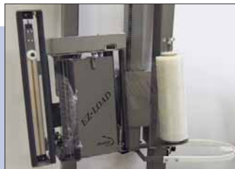
Standard Machine Carriage with Optional Pneumatic Roping Device