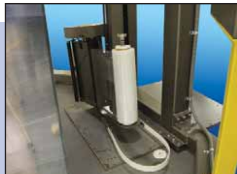
EZ-LOAD Carriage Assembly with Safety Hoop