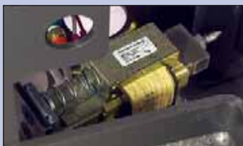
Optional Automatic Film Tear Device