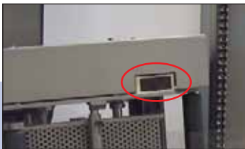
Guarded Photo Electronic Load Height Sensor