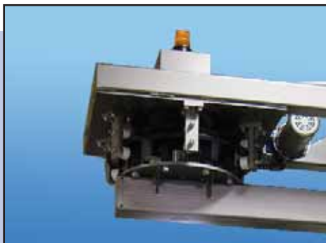
Swing Arm Support/Drive System with Safety Flashing Light